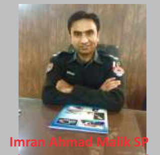
Peshawar Cantt is a regular reader of Al-Qanoon.

of Al-Qanoon) and it is re-launched in January 2017 for the legal education and to