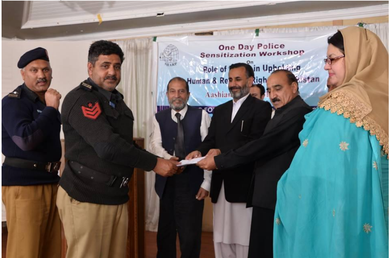
This year Police training was conducted by SHARP-Pakistan in Peshawar and police trainees are receiving certificates on the completion of trainings.