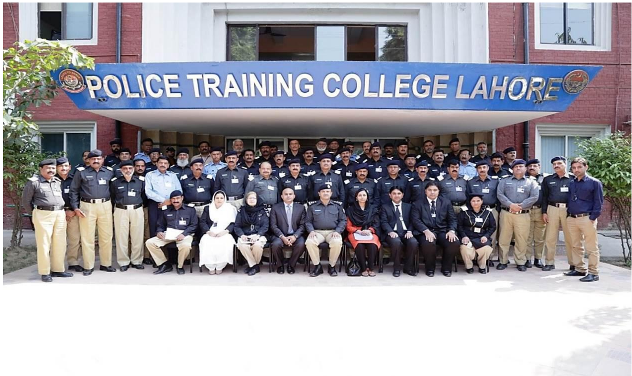
Group photo at the end of Police training at police training college Chung, Lahore on 9th March, 2016

Card has been extended till 30 th June, 2016 which makes their stay in Pakistan is legally till the date.