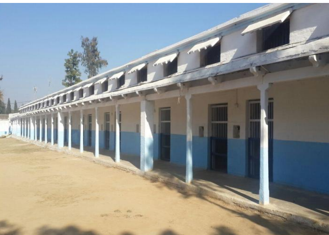
Juvenile sector after renovation