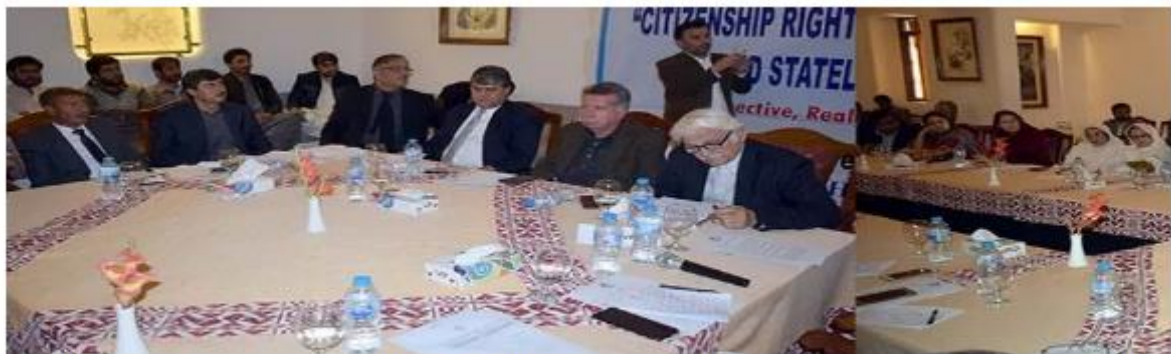
QUETTA: Speakers at a seminar on Afghan refugees in Quetta today called for enacting a Refugees Law including the internally displaced persons keeping in view all factors.