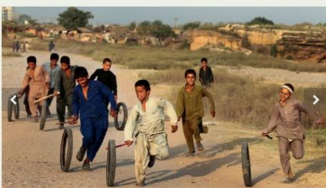
Afghan refugee children play with tires in Islamabad, Pakistan, on October 6, 2017. Prime Minister Imran Khan has offered citizenship to Pakistan-born Afghan and Bengali refugees.

Pakistani premier's citizenship offer to Afghans meets ire at home but gratitude in Afghanistan