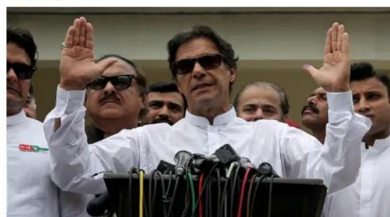
▲ Imran Khan swept to victory in elections in July and has pledged to forge a progressive Pakistan.

PM's offer reverses decades of hostility in official policy but analysts question motives